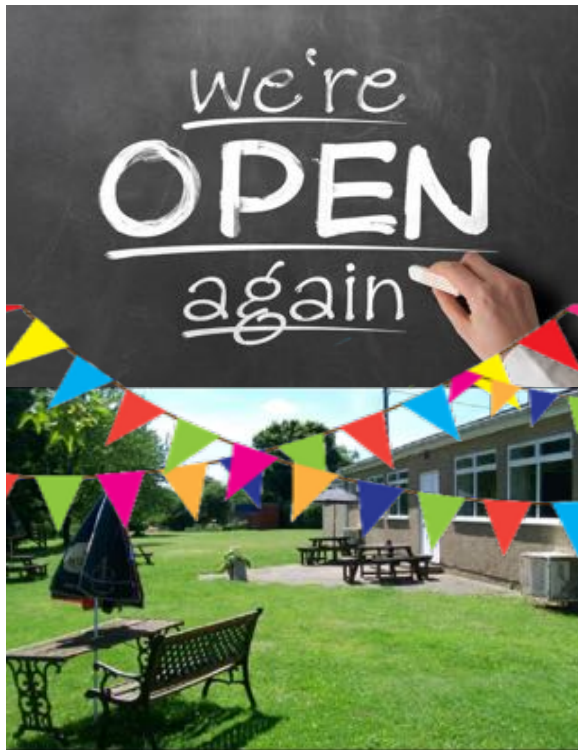
Braishfield Social Club re-opens

Distributed free of charge by the Braishfield Village Association to the residents of Braishfield and the surrounding hamlets and available in colour on the BVA website: