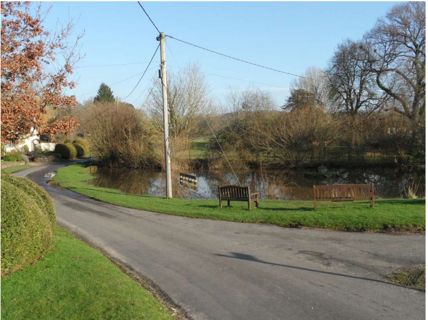
The village pond: water receding but still covering the viewing platform