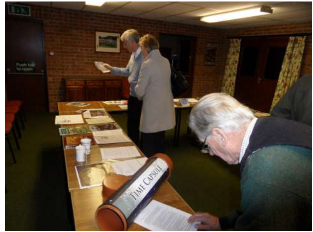
Items on display ready to load into the Time Capsule

'full Monty', consult the Village Website ( not the Time Capsule!).