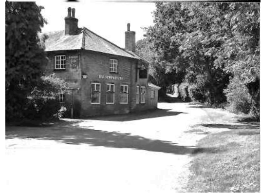
The Newport Inn