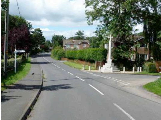
The War Memorial