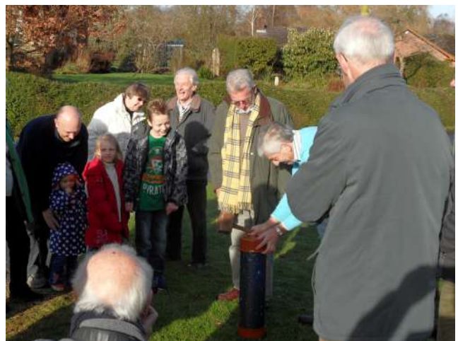
Villagers witness the sealing of the capsule

24. 2012 Olympics/Paralympics, London; views/involvement from Braishfield. 25. Farm heritage: Braishfield Manor, Fishponds & Fairbournes farms - observations. 26. URC: 2012 copies of monthly magazines and Orders of Service for special events. 27. All Saints Church; annual report 2011, magazines, Orders of Service, Consecration. 28. Parish Council; photo of 'honours board', and minutes of 1st and latest meeting. 29. A photograph of the 'Braishfield Tapestry' and some explanatory notes about it. 30. A memory stick; holds a full copy of this document with acknowledgements. 31. Christmas and New Year Greetings from Braishfield 2012 to AD....?!