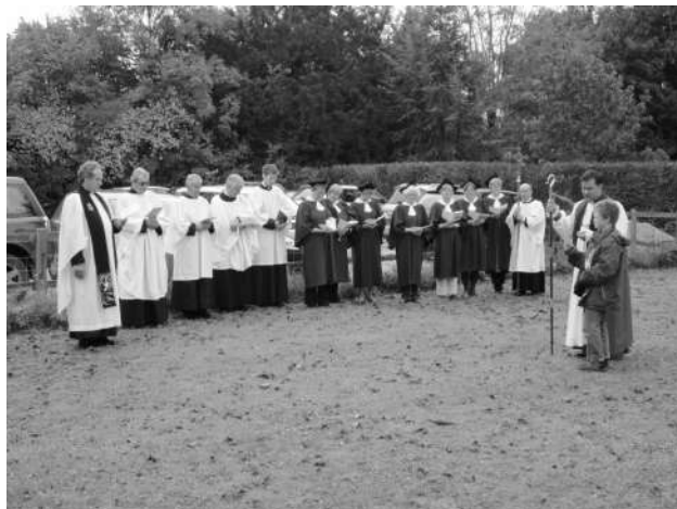
The Bishop of Southampton consecrates the extension to the churchyard before dedicating the new churchyard bench and the new gates