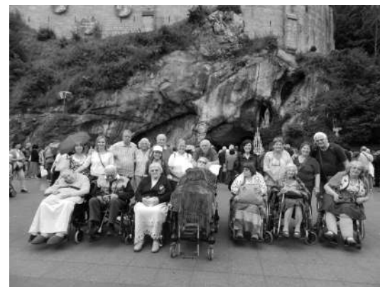
Our group at the Grotto, Lourdes