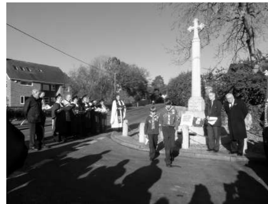
Two scouts lay their wreath