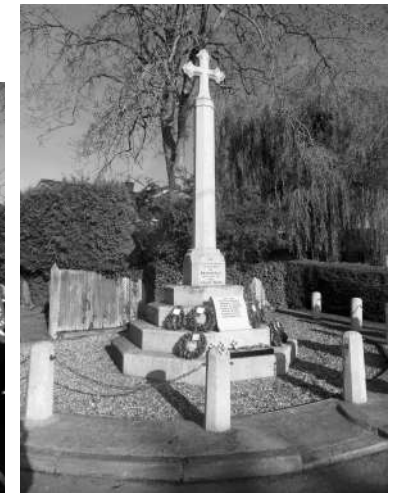
The War Memorial after the Service