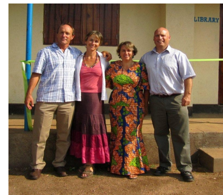
Braishfield Team at the School Opening Day

So all for now - the last 2 years in Uganda have flown by and we are extending our stay until 2013 until Jesse finishes school.