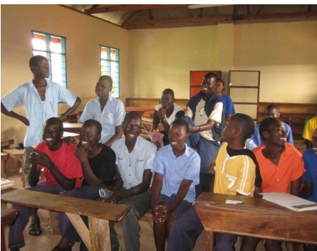
Final Day of Exams

For the first time ever, WTA (Wobulenzi Town Academy) was able to function as a full exam