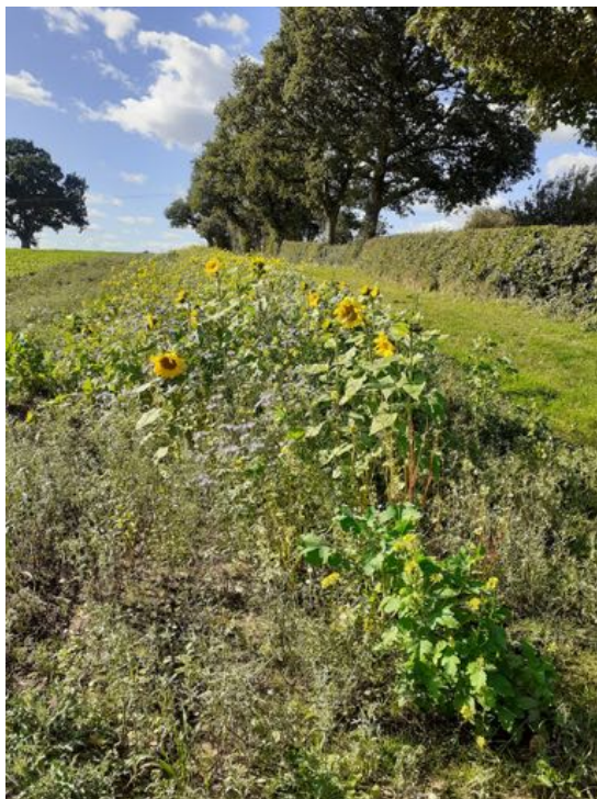
Wild flower border beside Footpath 4