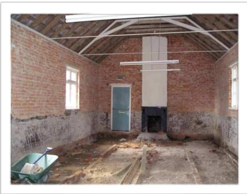
Gutted interior looking towards the fireplace, before the new window was put in

you missed the Exhibition a few weeks ago it will be on display again during our All Saints Gift Day on Saturday 25 th January. It is well worth a visit.