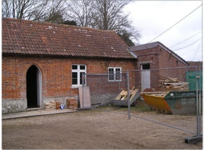
Before the entrance foyer was built, mower shed to right

Sitting in the Church Room enjoying coffee at the Celebration Exhibition on Saturday 2 nd November ten years after the completion of the refurbishment it was hard to take in that 10 years had passed – it all looks as fresh as the day it was dedicated on All Saints' Day 2009. The Exhibition covered two aspects: first, the history of the building, beginning with a 16 th century map showing a building on the site, then