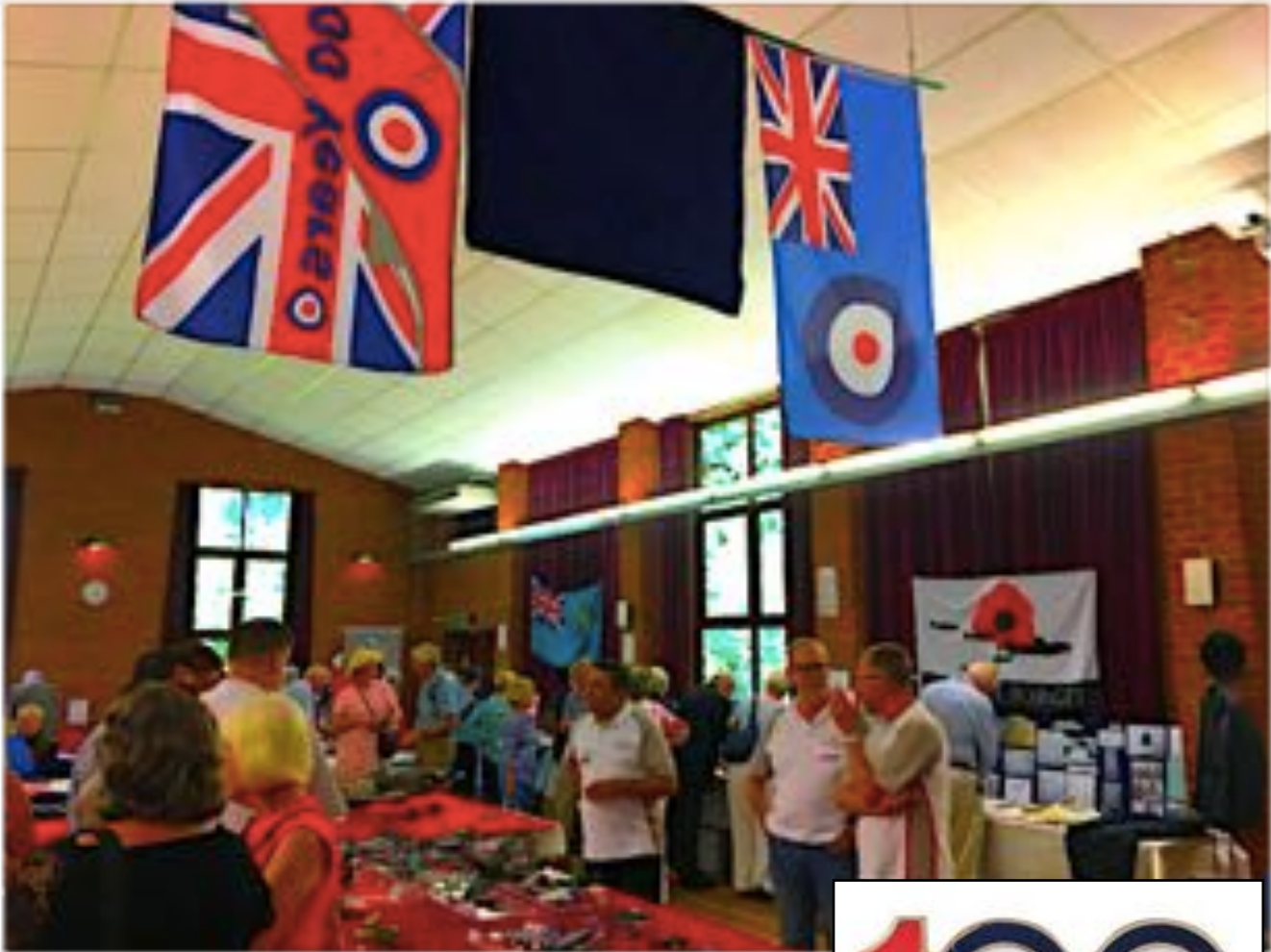
RAF 100 EVENT 2018