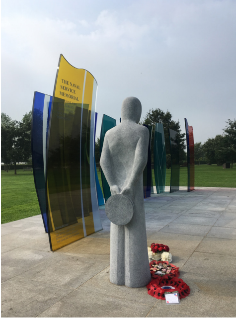
The Naval Service

'At the going down of the sun, and in the morning, we will remember them'